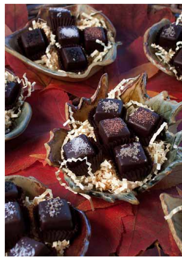
As readers thumb through Greeley's vibrant designs, mouths water and synapses fire with party planning inspiration. If sunny bouquets, skillets filled with warm, broccoli cornbread, and sea salted chocolates set in majolica pottery don't fill your belly with holiday warmth, then go dine with Scrooge.

The images inside The Collected Tabletop provide readers with a unique map of the renowned interior designer. Readers catch a glimpse of Greeley's travels, her favorite occasions, and the people who inspire her to collect and create. The thoughtfully crafted tabletops – adorned with a crème brulee recipe from Paris, a China pattern popular many years ago, hand painted invitations, and bright bursting blooms from her own garden – illustrate Greeley's unique design philosophy, "collected not decorated." These items weren't plucked from the pages of a magazine at whim; these are not empty design combinations. Greeley's designs are more than aesthetic; they are empathetic— conveying the shared experiences of Greeley and her guests.